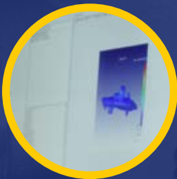
SIMULATION & 3D MODELLING